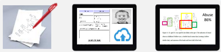
Step 1 Draw Picture Step 2 Upload Drawing Step 3 Receive analysis